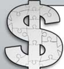
Table of Benefits